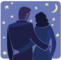
PARENTS NIGHT OUT